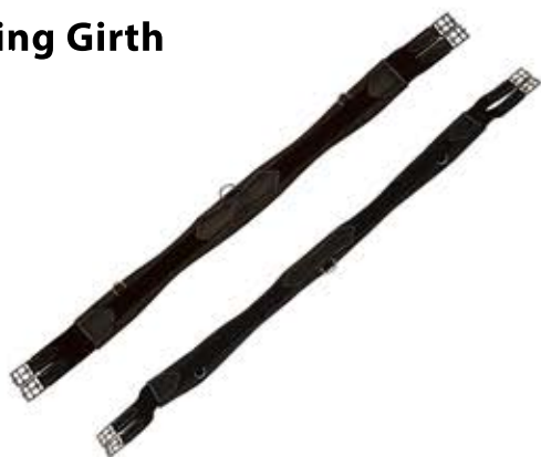
2075DB/2075B € 120,90 - € 128,90 Sizes for 2075DB/B: 48, 50, 52, 54, 56cm