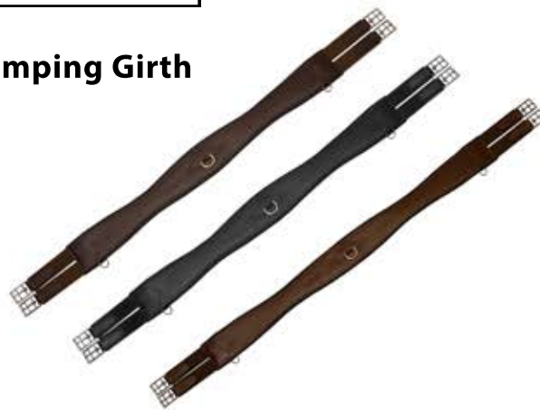
2077DB/2077B/2077T € 181,90 Sizes for 2077DB/B/T: 120, 125, 130, 135, 140cm

Made from almost 100% ThinLine material, this is a low-maintenance girth with superior performance. With roller buckles, double ended elastic, leather reinforcements, D-rings, and rounded edges, this girth will equalize pressure and keep horses supremely comfortable while preventing the spread of fungus and rain rot.