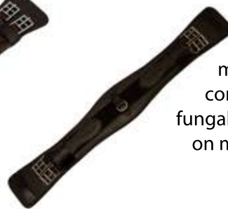
2085-B Dressage Girth

This girth has elastic in the middle with roller buckles on both ends. Leather with ThinLine lining makes this a completely comfortable, no slip, anti-fungal girth that can be used on multiple horses without spreading fungus.